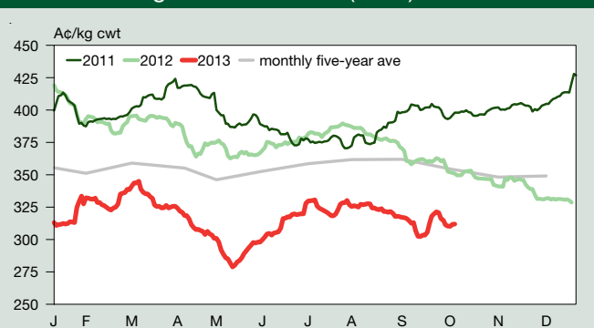
Figure 2 Eastern Young Cattle Indicator (EYCI)