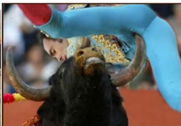
Figure 1. In domesticated cattle poor temperament can be exhibited as flight or fight.