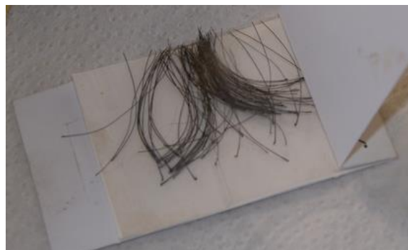
Figure 2. Collecting a DNA Sample for DNA parent verification, pull 20-30 thick hairs from the brush of the animal's tail including the hair roots.

The genotyping laboratories offering this service in Australia (e.g. Zoetis Genetics and AGL) generally use tail hair samples (hair roots attached) as a source of DNA, however they can use other samples such as blood, semen or tissue if required. Most breed societies have regulations for DNA